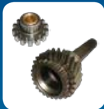
Shafts & Gears