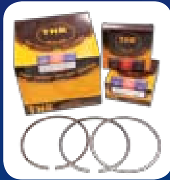
Piston Ring set