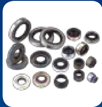
Oil Seal, Valve Seal